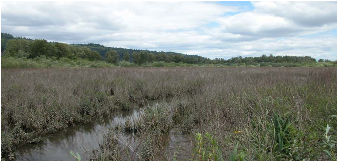
View to northwest. June, 2006