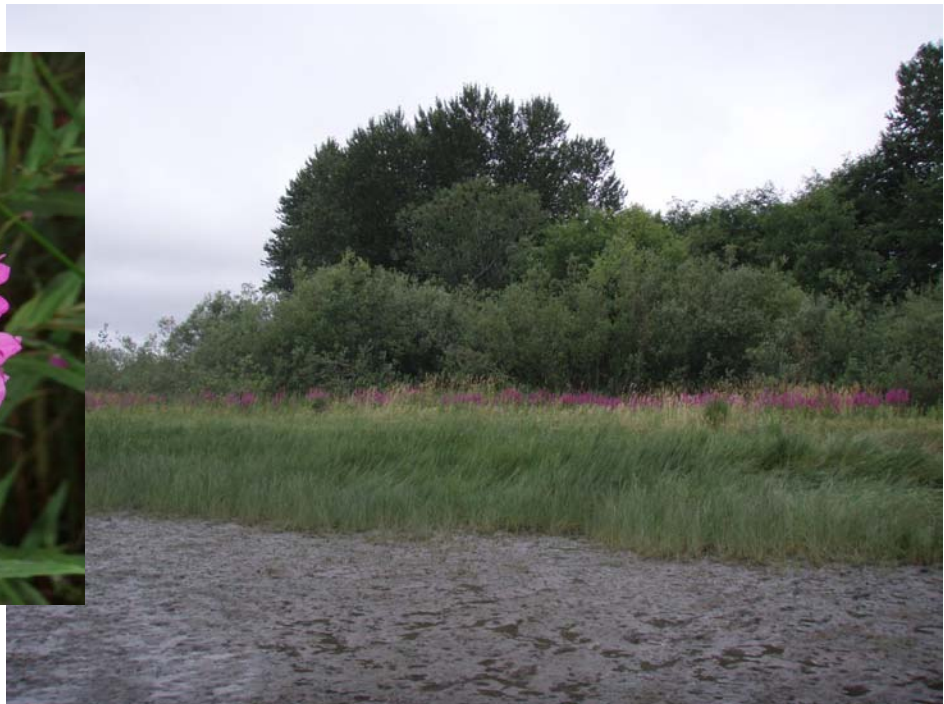
Right: Site photo, looking north. Above: Pollinator on purple loosestrife ( Lythrum salicaria ). July, 2006.