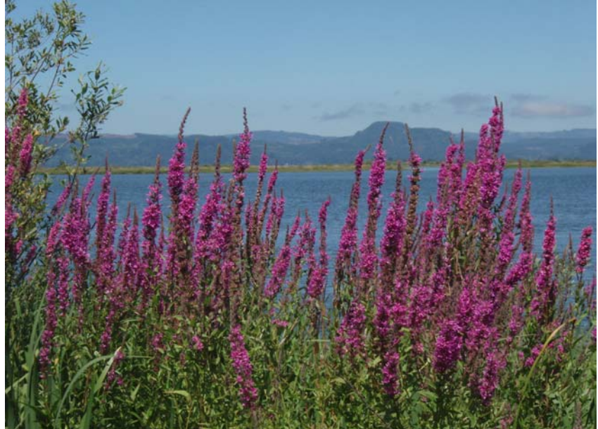
View north. July, 2006.