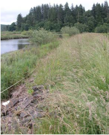
View south; toward the biocontrol release point. June, 2006