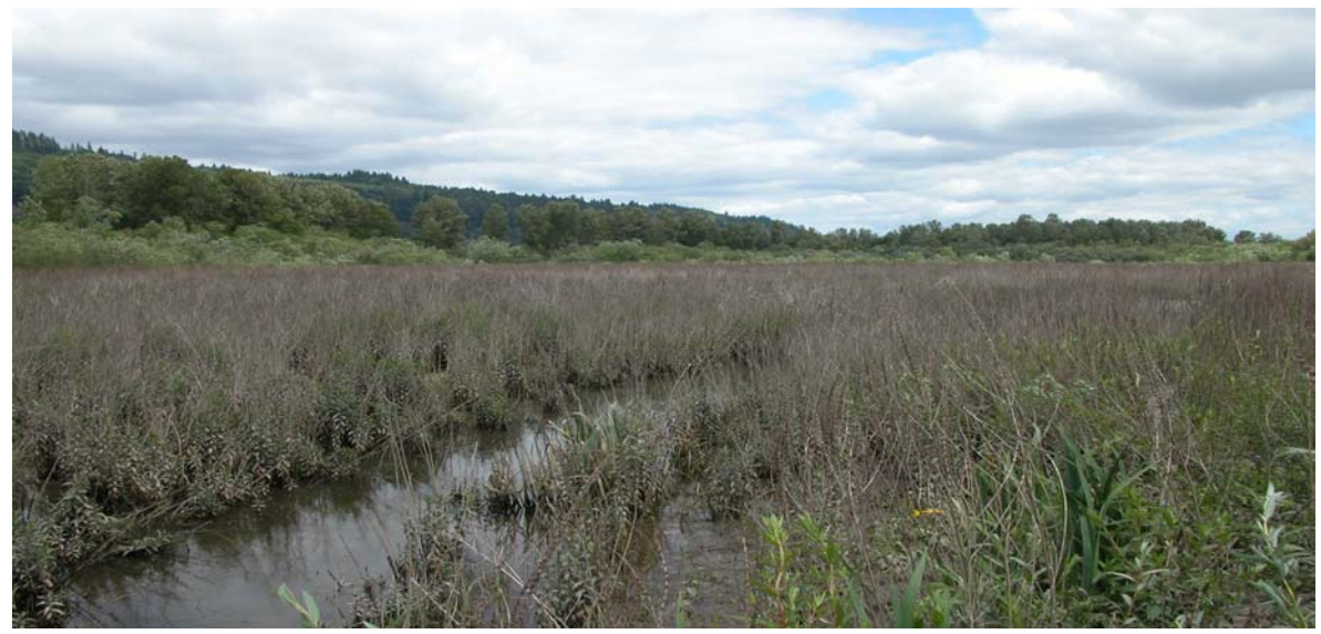
View to northwest. June, 2006