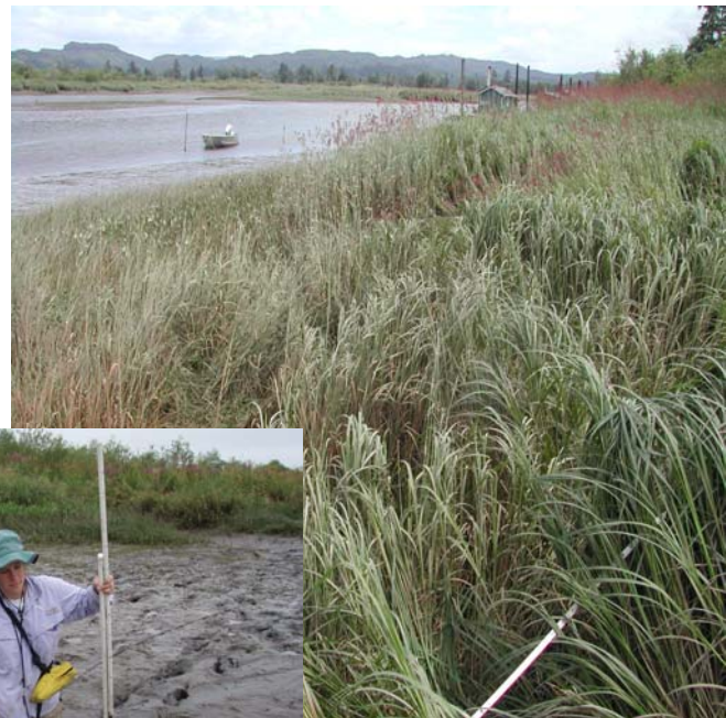
View from east side of site. June, 2006.