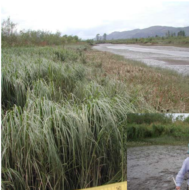
View from west side of site. June, 2006.