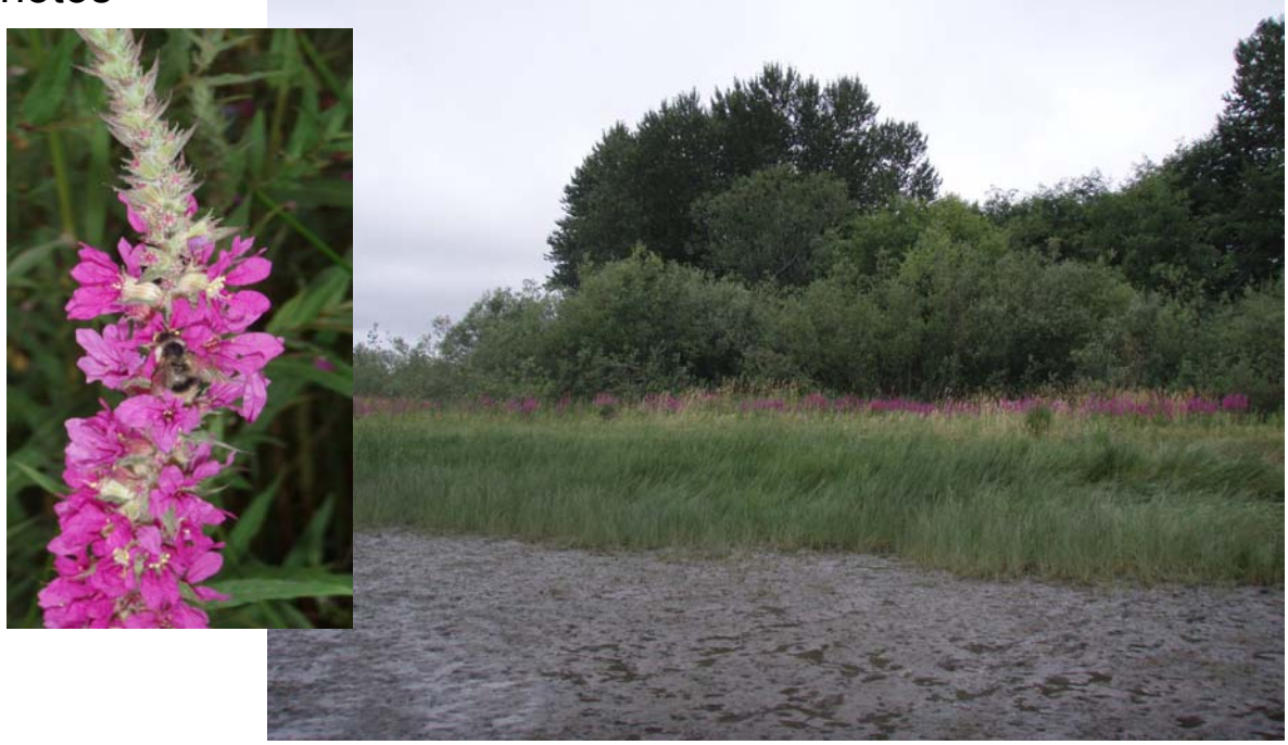
Right: Site photo, looking north. Above: Pollinator on purple loosestrife (Lythrum salicaria). July, 2006.