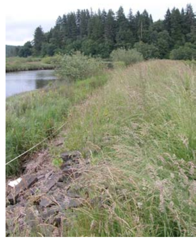
View south; toward the biocontrol release point. June, 2006